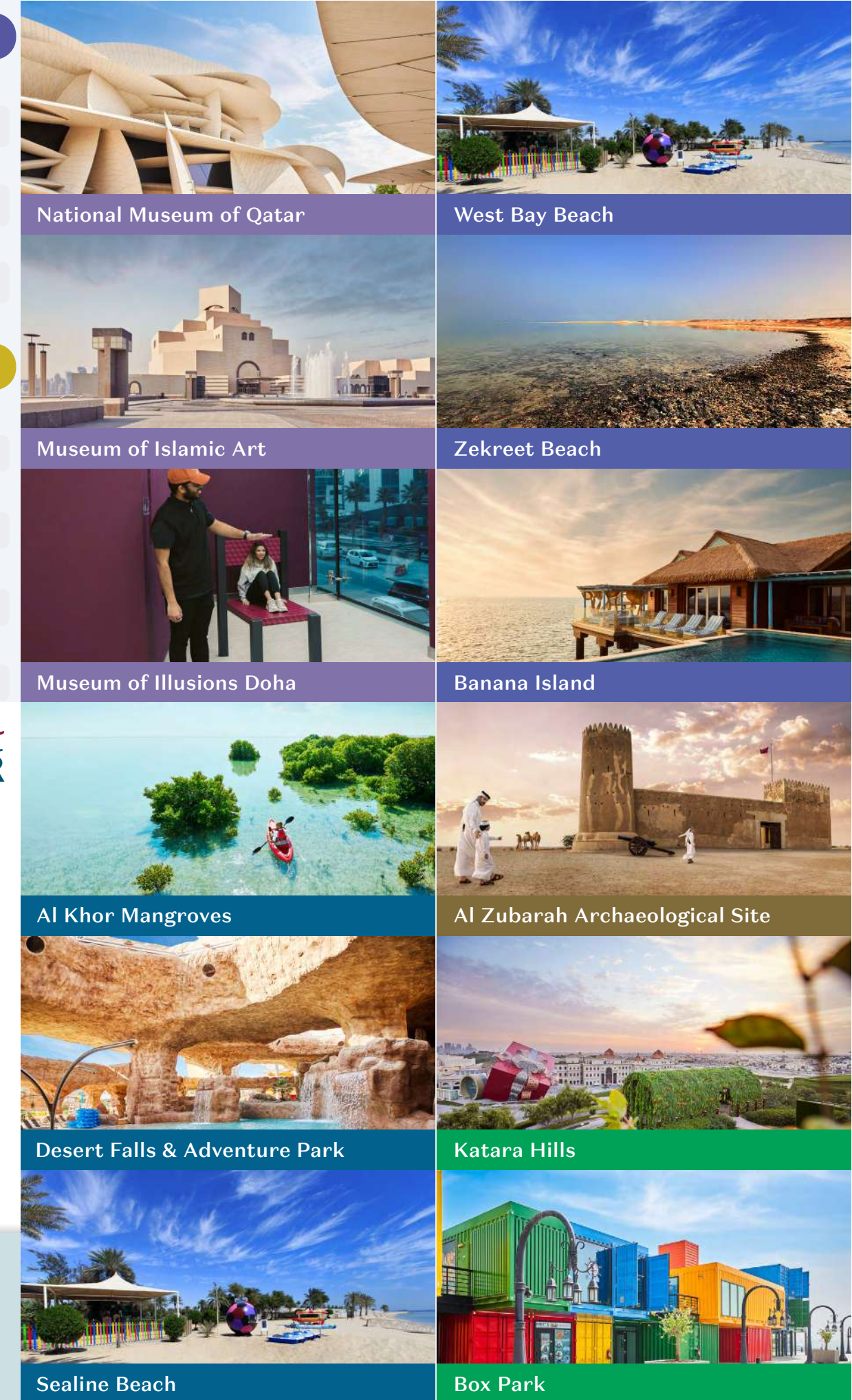
National Museum of Qatar

Available in 8 Languages DOWNLOAD THE APP VISIT QATAR VISITQATAR.COM